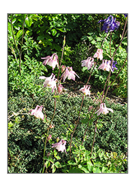
Fan Columbine flowers

Attractive shell pink flowers with snowy white edged cups and interesting spurred petals rise over the medium green delicate foliage; a wonderful addition to border edges or massed in the garden; will tend to self seed