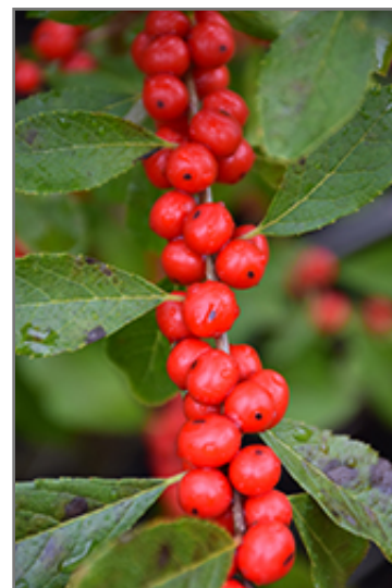
Red Sprite Winterberry fruit