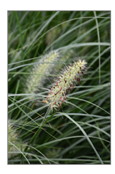
Little Bunny Dwarf Fountain Grass flowers

This plant should only be grown in full sunlight. It is very adaptable to both dry and moist growing conditions, but will not tolerate any standing water. It is considered to be drought-tolerant, and thus makes an ideal choice for a low-water garden or xeriscape application. It is not particular as to soil type or pH, and is able to handle environmental salt. It is somewhat tolerant of urban pollution. This is a selected variety of a species not originally from North America. It can be propagated by division; however, as a cultivated variety, be aware that it may be subject to certain restrictions or prohibitions on propagation.