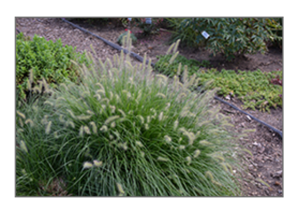
Little Bunny Dwarf Fountain Grass in bloom

Little Bunny Dwarf Fountain Grass is recommended for the following landscape applications;