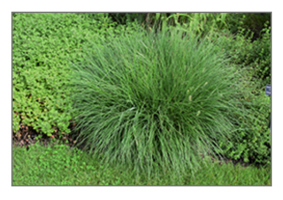
Little Bunny Dwarf Fountain Grass