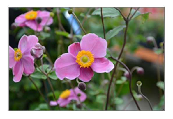
September Charm Anemone flowers