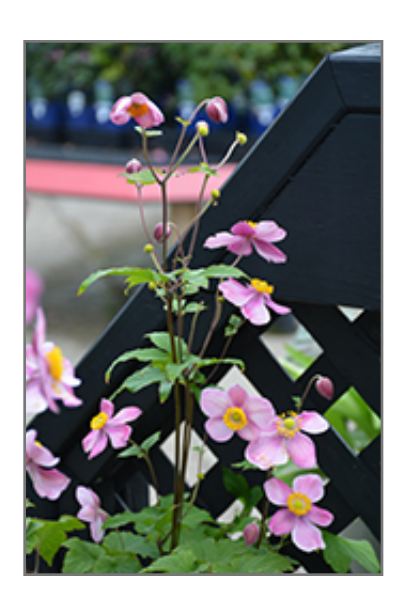
September Charm Anemone flowers

This plant does best in full sun to partial shade. It prefers to grow in average to moist conditions, and shouldn't be allowed to dry out. It is not particular as to soil type or pH. It is somewhat tolerant of urban pollution. Consider applying a thick mulch around the root zone in winter to protect it in exposed locations or colder microclimates. This particular variety is an interspecific hybrid. It can be propagated by division; however, as a cultivated variety, be aware that it may be subject to certain restrictions or prohibitions on propagation.