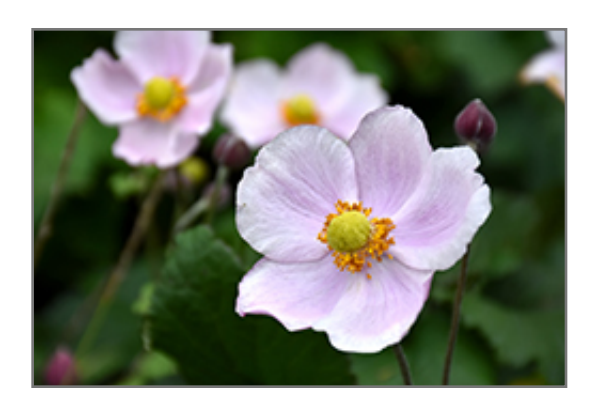
September Charm Anemone flowers

September Charm Anemone is recommended for the following landscape applications;