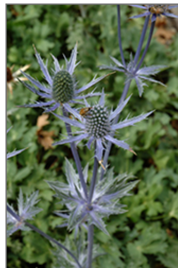
Big Blue Sea Holly flowers

Big Blue Sea Holly is recommended for the following landscape applications;