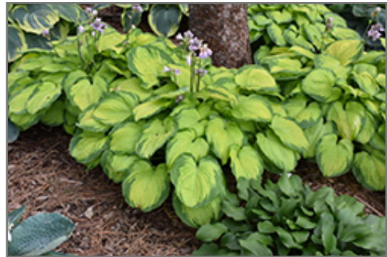
Old Glory Hosta