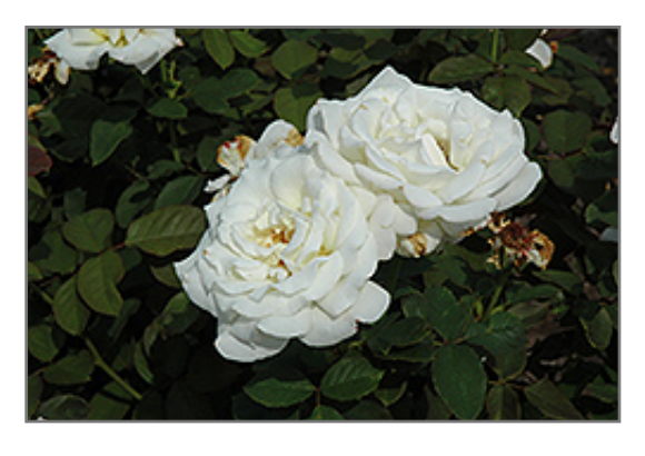
Pope John Paul II Rose flowers

This shrub will require occasional maintenance and upkeep, and is best pruned in late winter once the threat of extreme cold has passed. Gardeners should be aware of the following characteristic(s) that may warrant special consideration;