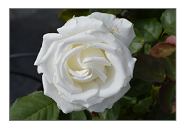
Pope John Paul II Rose flowers

Pope John Paul II Rose is a multi-stemmed deciduous shrub with an upright spreading habit of growth. Its average texture blends into the landscape, but can be balanced by one or two finer or coarser trees or shrubs for an effective composition.