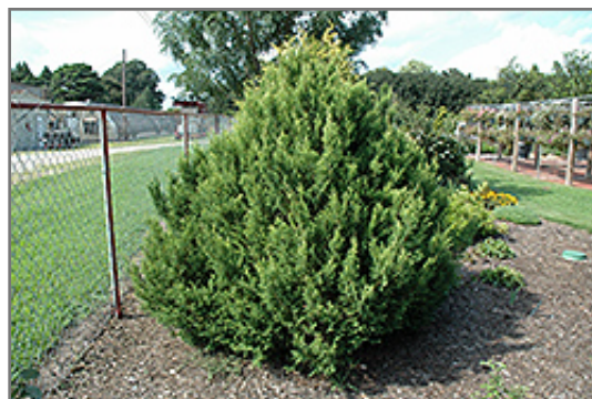
Cream Ball Falsecypress

Cream Ball Falsecypress is recommended for the following landscape applications;