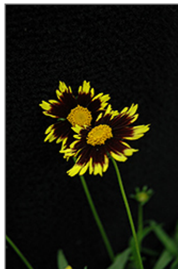
Cosmic Eye Tickseed flowers

Cosmic Eye Tickseed is recommended for the following landscape applications;