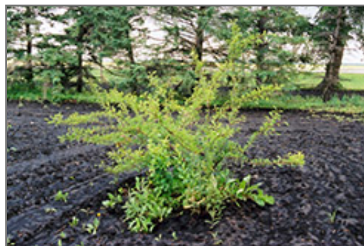
Sapalta Cherry-Plum