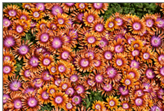
Fire Spinner Ice Plant in bloom

Fire Spinner Ice Plant is recommended for the following landscape applications;