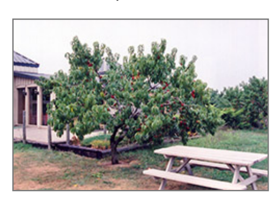
Hardired Nectarine