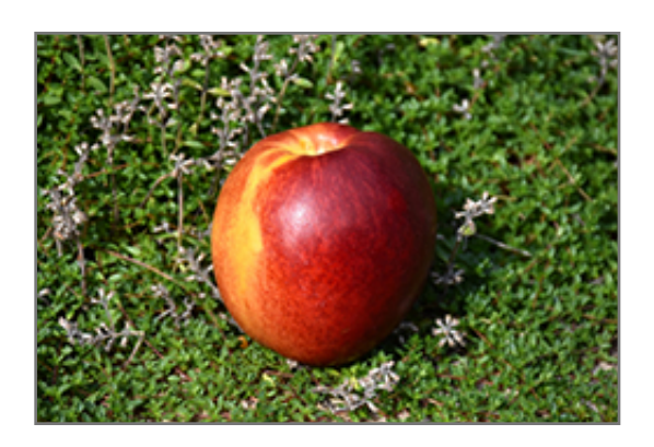
Hardired Nectarine fruit

Hardired Nectarine is blanketed in stunning clusters of fragrant pink flowers along the branches in early spring, which emerge from distinctive rose flower buds before the leaves. It has dark green deciduous foliage. The narrow leaves turn yellow in fall. The fruits are showy scarlet drupes with hints of yellow, which are carried in abundance in mid summer. The fruit can be messy if allowed to drop on the lawn or walkways, and may require occasional clean-up.