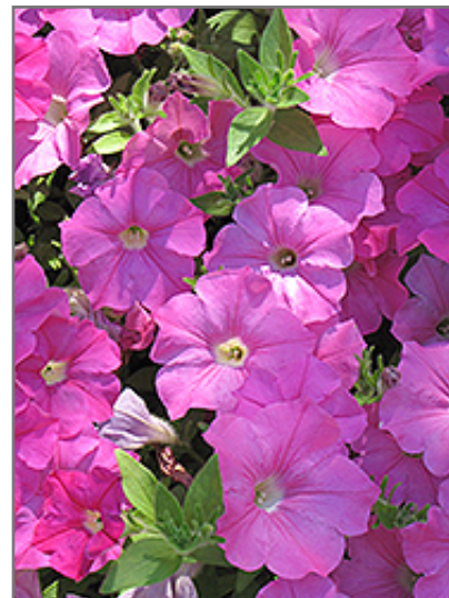
Easy Wave Pink Petunia flowers

Easy Wave Pink Petunia is a dense herbaceous annual with a trailing habit of growth, eventually spilling over the edges of hanging baskets and containers. Its medium texture blends into the garden, but can always be balanced by a couple of finer or coarser plants for an effective composition.