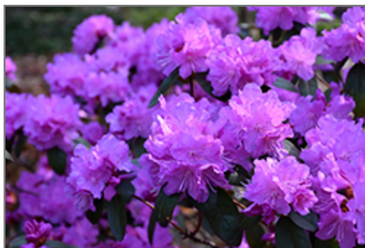
P.J.M. Elite Rhododendron flowers

P.J.M. Elite Rhododendron is recommended for the following landscape applications;