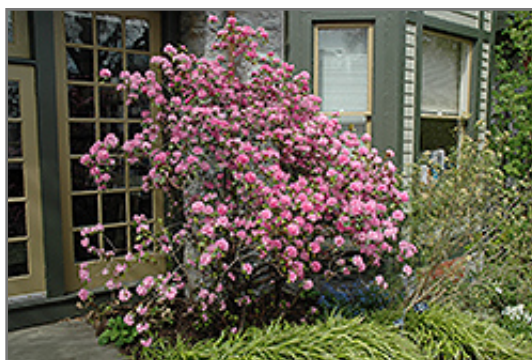
Olga Mezitt Rhododendron in bloom