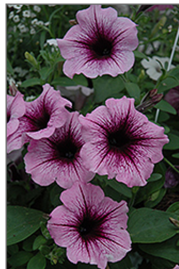
Supertunia Bordeaux Petunia flowers

Supertunia Bordeaux Petunia is recommended for the following landscape applications;