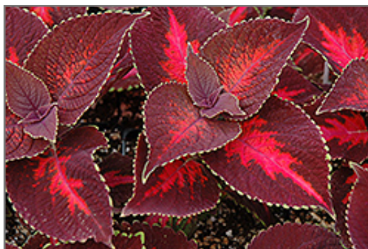
ColorBlaze Kingswood Torch Coleus foliage