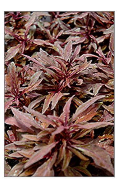
ColorBlaze Velvet Mocha Coleus foliage