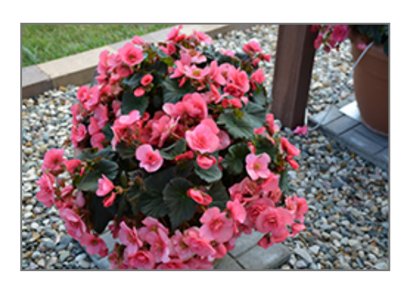
Solenia Light Pink Begonia in bloom

Solenia Light Pink Begonia will grow to be about 12 inches tall at maturity, with a spread of 12 inches. When grown in masses or used as a bedding plant, individual plants should be spaced approximately 10 inches apart. Its foliage tends to remain dense right to the ground, not requiring facer plants in front. The flower stalks can be weak and so it may require staking in exposed sites or excessively rich soils. Although it's not a true annual, this plant can be expected to behave as an annual in our climate if left outdoors over the winter, usually needing replacement the following year. As such, gardeners should take into consideration that it will perform differently than it would in its native habitat.