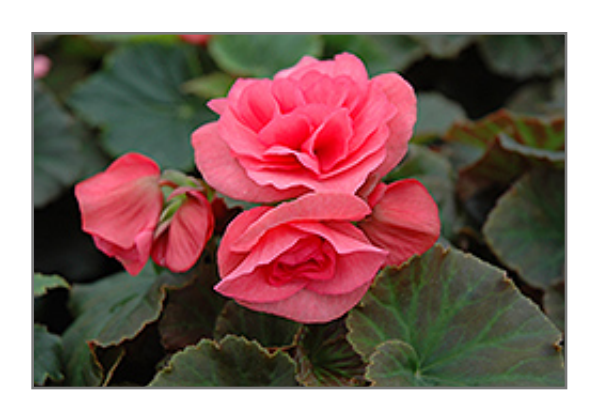
Solenia Light Pink Begonia flowers

This is a high maintenance plant that will require regular care and upkeep, and usually looks its best without pruning, although it will tolerate pruning. Deer don't particularly care for this plant and will usually leave it alone in favor of tastier treats. Gardeners should be aware of the following characteristic(s) that may warrant special consideration;