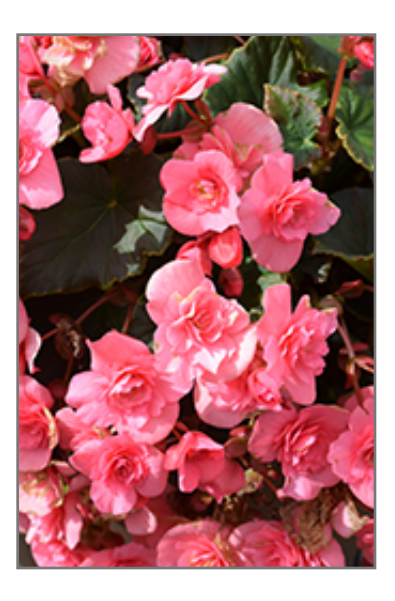
Solenia Light Pink Begonia flowers