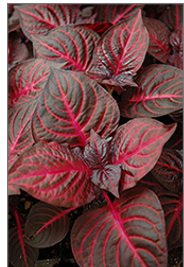
Blazin' Rose Blood Leaf foliage