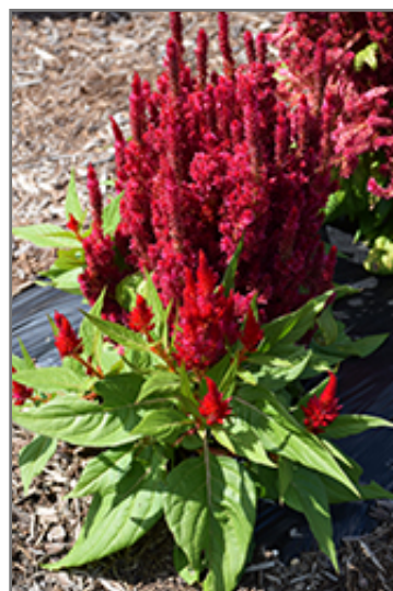
Fresh Look Red Celosia in bloom