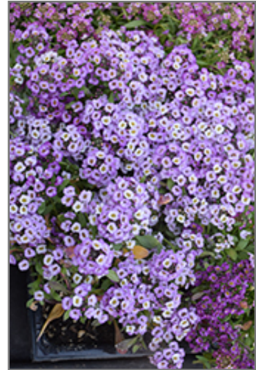
Clear Crystal Lavender Shades Sweet Alyssum flowers

Clear Crystal Lavender Shades Sweet Alyssum is recommended for the following landscape applications;