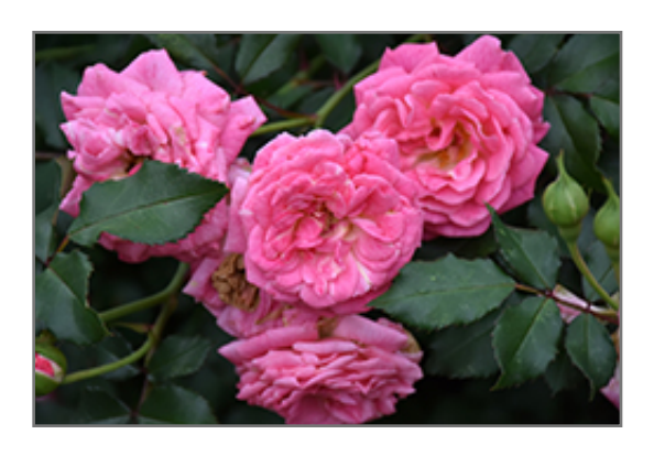
Sweet Drift Rose flowers

This shrub should only be grown in full sunlight. It does best in average to evenly moist conditions, but will not tolerate standing water. It is not particular as to soil type or pH. It is highly tolerant of urban pollution and will even thrive in inner city environments. This particular variety is an interspecific hybrid.