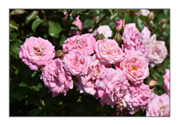
Sweet Drift Rose flowers

Sweet Drift Rose is recommended for the following landscape applications;