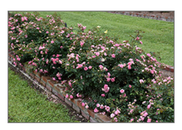
Sweet Drift Rose in bloom