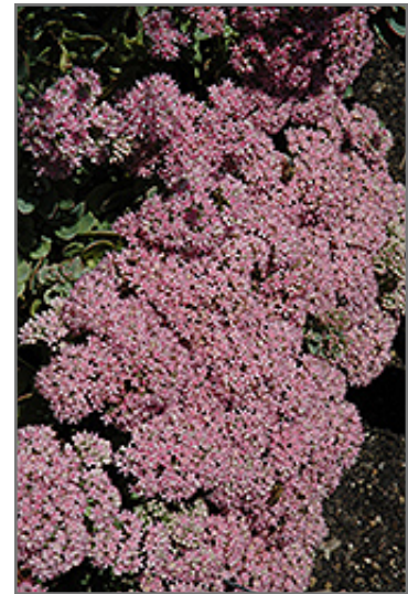
Lime Zinger Stonecrop flowers

This is a relatively low maintenance plant, and is best cleaned up in early spring before it resumes active growth for the season. It is a good choice for attracting bees and butterflies to your yard, but is not particularly attractive to deer who tend to leave it alone in favor of tastier treats. It has no significant negative characteristics.