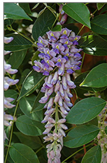
Summer Cascade Wisteria flowers

This is a high maintenance woody vine that will require regular care and upkeep, and should only be pruned after flowering to avoid removing any of the current season's flowers. It is a good choice for attracting hummingbirds to your yard, but is not particularly attractive to deer who tend to leave it alone in favor of tastier treats. Gardeners should be aware of the following characteristic(s) that may warrant special consideration;