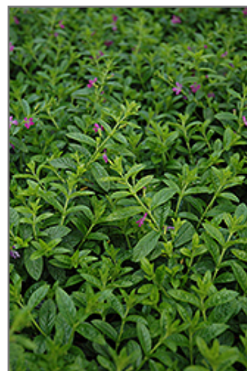
Allyson Mexican Heather foliage