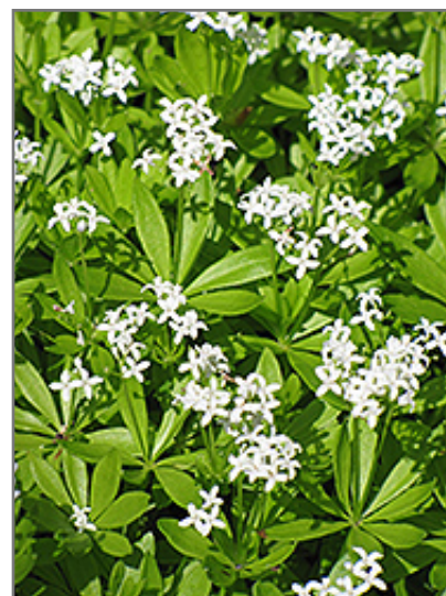
Sweet Woodruff flowers