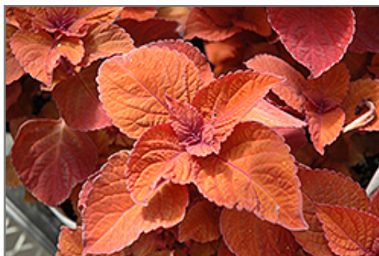
ColorBlaze Keystone Kopper Coleus foliage