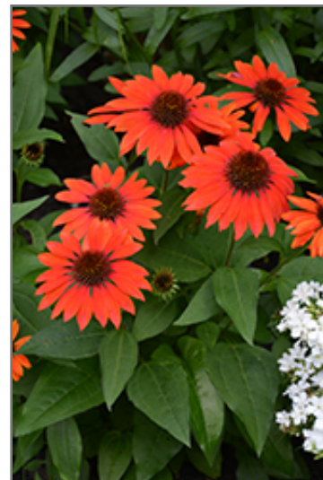
Sombrero Flamenco Orange Coneflower in bloom

Sombrero Flamenco Orange Coneflower is recommended for the following landscape applications;