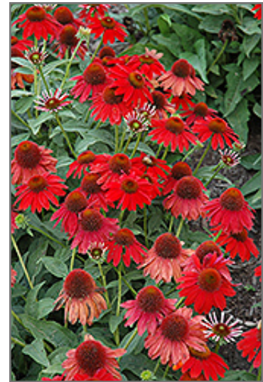
Sombrero Salsa Red Coneflower flowers

This is a relatively low maintenance plant, and is best cleaned up in early spring before it resumes active growth for the season. It is a good choice for attracting butterflies to your yard, but is not particularly attractive to deer who tend to leave it alone in favor of tastier treats. It has no significant negative characteristics.