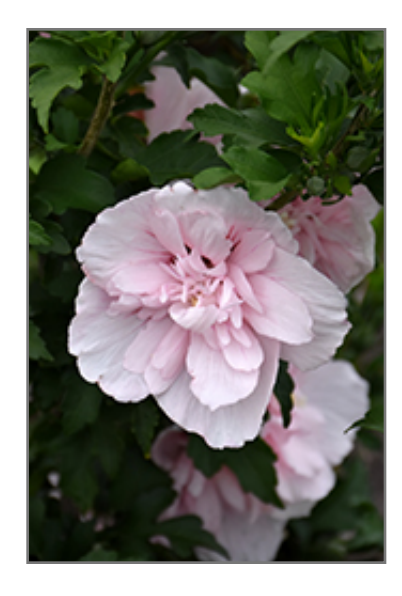
Pink Chiffon Rose of Sharon flowers

Pink Chiffon Rose of Sharon is a multi-stemmed deciduous shrub with an upright spreading habit of growth. Its average texture blends into the landscape, but can be balanced by one or two finer or coarser trees or shrubs for an effective composition.