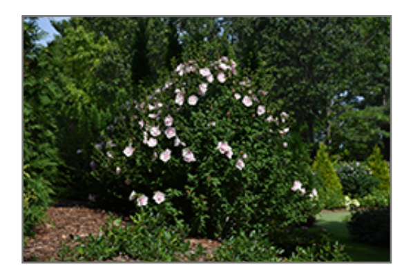
Pink Chiffon Rose of Sharon in bloom

This is a high maintenance shrub that will require regular care and upkeep, and is best pruned in late winter once the threat of extreme cold has passed. It is a good choice for attracting butterflies and hummingbirds to your yard, but is not particularly attractive to deer who tend to leave it alone in favor of tastier treats. Gardeners should be aware of the following characteristic(s) that may warrant special consideration;