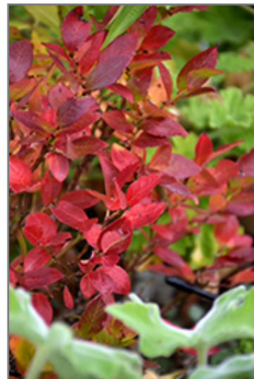
Jelly Bean Blueberry in fall

Jelly Bean Blueberry features dainty clusters of white bell-shaped flowers with shell pink overtones hanging below the branches in mid spring. It has red-variegated green foliage. The glossy oval leaves turn an outstanding red in the fall. It features an abundance of magnificent blue berries in mid summer.