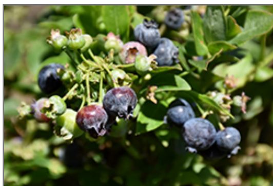
Jelly Bean Blueberry fruit