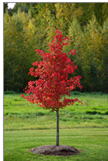
Wildfire Black Gum in fall