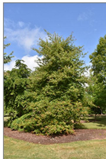
Wildfire Black Gum