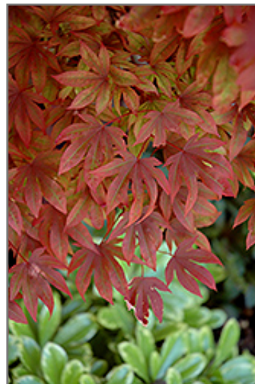
Adrians Compact Japanese Maple foliage