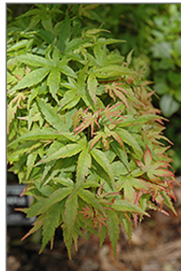
Sharp's Pygmy Japanese Maple foliage

Sharp's Pygmy Japanese Maple is recommended for the following landscape applications;