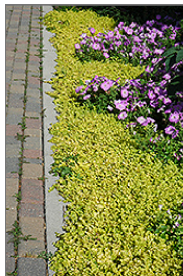
Golden Creeping Jenny