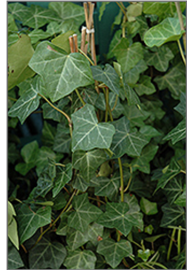
Thorndale Ivy foliage

Thorndale Ivy is recommended for the following landscape applications;