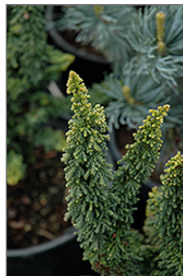
Chirimen Hinoki Falsecypress foliage