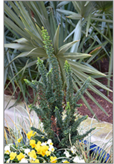
Chirimen Hinoki Falsecypress

Chirimen Hinoki Falsecypress makes a fine choice for the outdoor landscape, but it is also well-suited for use in outdoor pots and containers. With its upright habit of growth, it is best suited for use as a 'thriller' in the 'spiller-thriller-filler' container combination; plant it near the center of the pot, surrounded by smaller plants and those that spill over the edges. Note that when grown in a container, it may not perform exactly as indicated on the tag - this is to be expected. Also note that when growing plants in outdoor containers and baskets, they may require more frequent waterings than they would in the yard or garden.