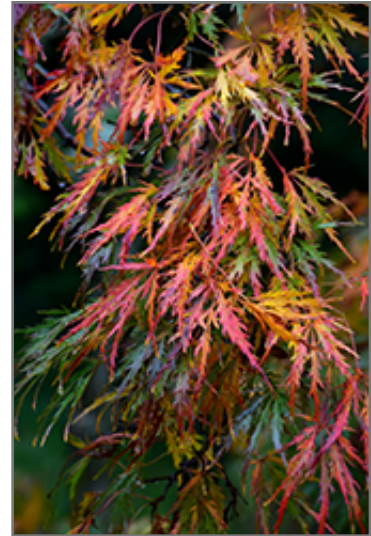
Cutleaf Japanese Maple in fall

Cutleaf Japanese Maple makes a fine choice for the outdoor landscape, but it is also well-suited for use in outdoor pots and containers. Because of its height, it is often used as a 'thriller' in the 'spiller-thriller-filler' container combination; plant it near the center of the pot, surrounded by smaller plants and those that spill over the edges. It is even sizeable enough that it can be grown alone in a suitable container. Note that when grown in a container, it may not perform exactly as indicated on the tag - this is to be expected. Also note that when growing plants in outdoor containers and baskets, they may require more frequent waterings than they would in the yard or garden.