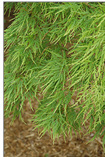
Cutleaf Japanese Maple foliage

Cutleaf Japanese Maple is recommended for the following landscape applications;