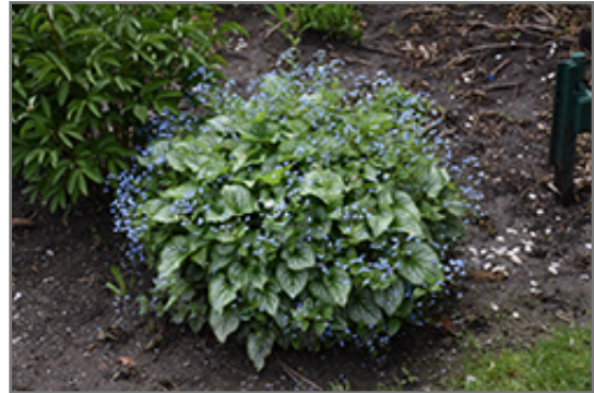
Sea Heart Bugloss in bloom

Sea Heart Bugloss will grow to be about 12 inches tall at maturity extending to 16 inches tall with the flowers, with a spread of 18 inches. When grown in masses or used as a bedding plant, individual plants should be spaced approximately 14 inches apart. It grows at a medium rate, and under ideal conditions can be expected to live for approximately 10 years. As an herbaceous perennial, this plant will usually die back to the crown each winter, and will regrow from the base each spring. Be careful not to disturb the crown in late winter when it may not be readily seen!