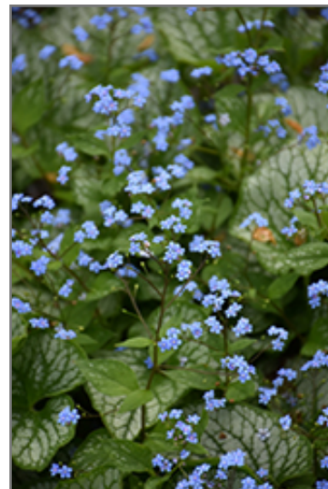
Sea Heart Bugloss flowers

Sea Heart Bugloss is recommended for the following landscape applications;