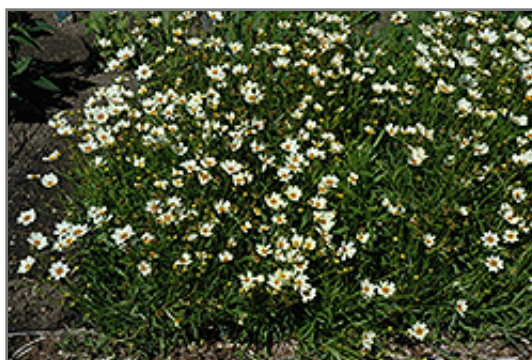
Star Cluster Tickseed in bloom