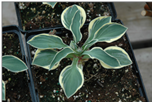
Funny Mouse Hosta foliage