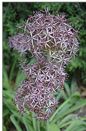
Star Of Persia Onion flowers