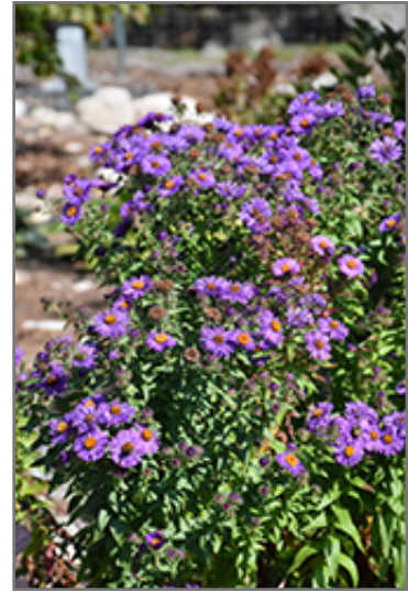
Purple Beauty Aster flowers

This plant does best in full sun to partial shade. It prefers to grow in average to moist conditions, and shouldn't be allowed to dry out. It is not particular as to soil type or pH. It is somewhat tolerant of urban pollution. This is a selection of a native North American species. It can be propagated by division; however, as a cultivated variety, be aware that it may be subject to certain restrictions or prohibitions on propagation.