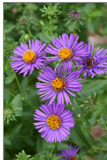
Purple Beauty Aster flowers