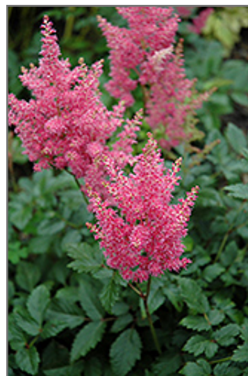
Rheinland Astilbe flowers

Rheinland Astilbe is recommended for the following landscape applications;