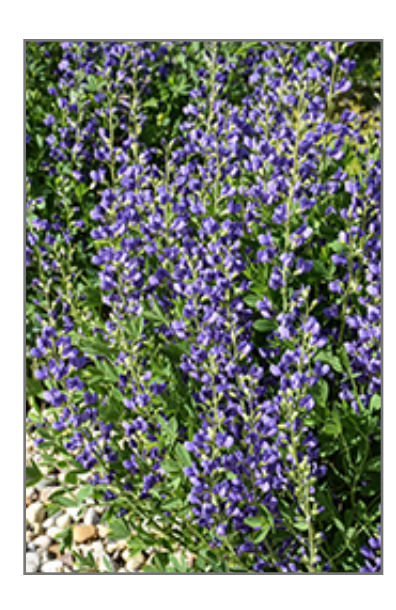
Blue Wild Indigo flowers

This is a relatively low maintenance plant, and is best cleaned up in early spring before it resumes active growth for the season. It is a good choice for attracting bees and butterflies to your yard. It has no significant negative characteristics.