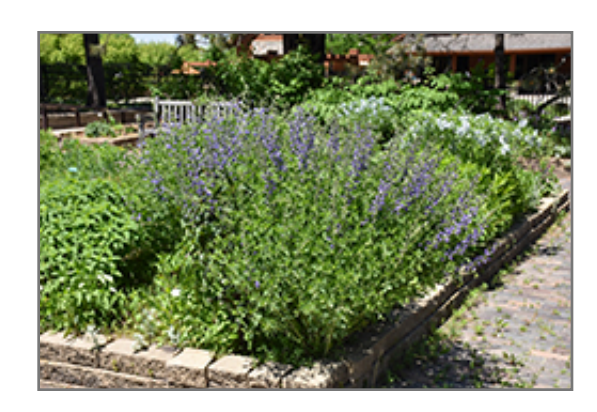
Blue Wild Indigo flowers

Blue Wild Indigo will grow to be about 3 feet tall at maturity extending to 4 feet tall with the flowers, with a spread of 3 feet. It grows at a slow rate, and under ideal conditions can be expected to live for approximately 25 years. As an herbaceous perennial, this plant will usually die back to the crown each winter, and will regrow from the base each spring. Be careful not to disturb the crown in late winter when it may not be readily seen!