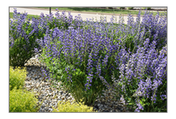
Blue Wild Indigo in bloom