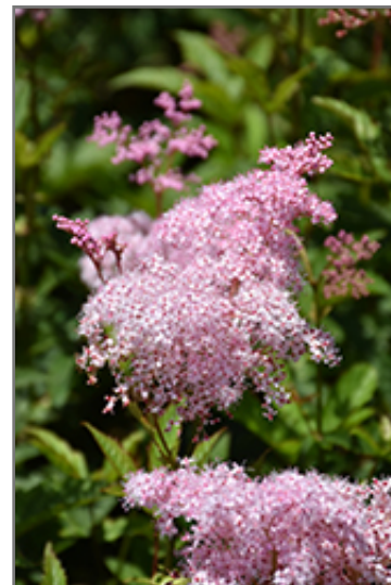
Queen Of The Prairie flowers