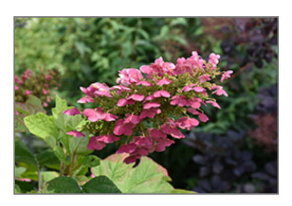
Gatsby Gal Hydrangea flowers

This shrub does best in full sun to partial shade. It prefers to grow in average to moist conditions, and shouldn't be allowed to dry out. It is not particular as to soil type or pH. It is somewhat tolerant of urban pollution, and will benefit from being planted in a relatively sheltered location. Consider applying a thick mulch around the root zone in winter to protect it in exposed locations or colder microclimates. This is a selection of a native North American species.