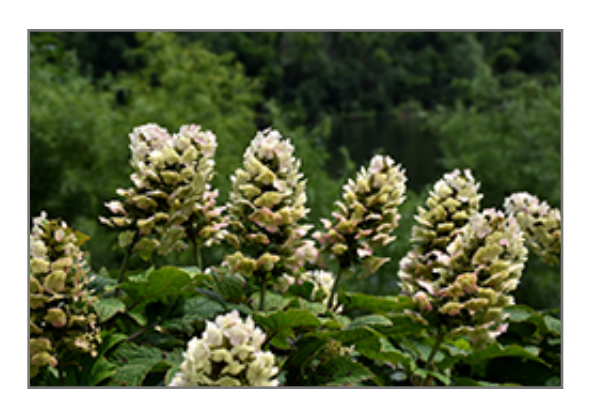
Gatsby Gal Hydrangea flowers

Gatsby Gal Hydrangea is recommended for the following landscape applications;