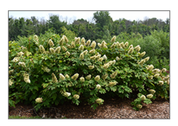
Gatsby Gal Hydrangea in bloom