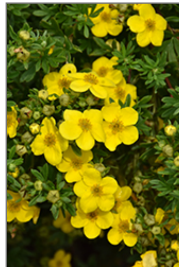
Happy Face Yellow Potentilla flowers

Happy Face Yellow Potentilla is recommended for the following landscape applications;