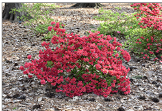
Girard's Crimson Azalea in bloom